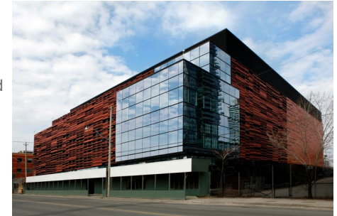
Equinix TR2 IBX exterior