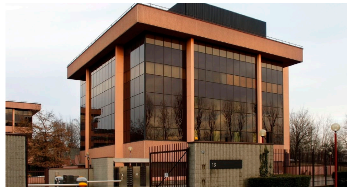
Equinix ML3 IBX data center exterior

The Milan IBX data centers consist of four buildings with a combined 66,000+ square feet (6,200+ square meters) of scalable colocation space featuring fully redundant power supplies to ensure operational resiliency and world-class security. All three are in close proximity to the city’s established business districts.