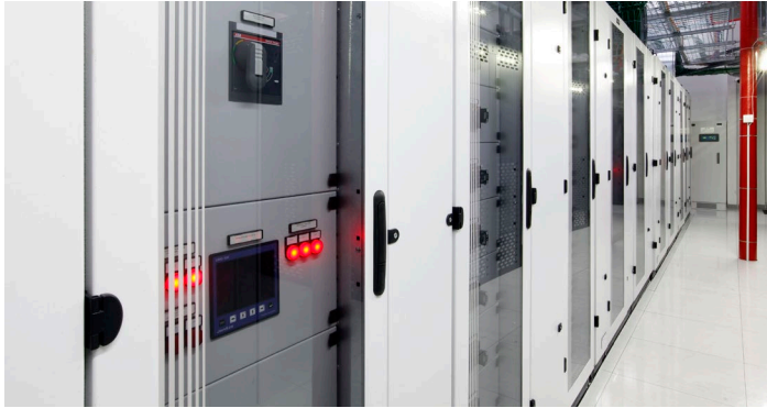
Equinix ML2 IBX data center interior